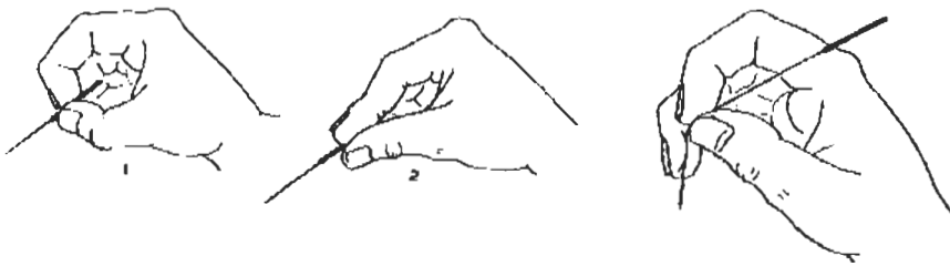
Techniques for inserting needles

The technique of inserting the needles is simple but requires practice if it is to be done skilfully and relatively painlessly. Acquiring good needle technique is an important part of achieving success in acupuncture. It is customary to begin by needling oranges , but these don't give the same sensation as needling patients. A better simulation can be achieved by